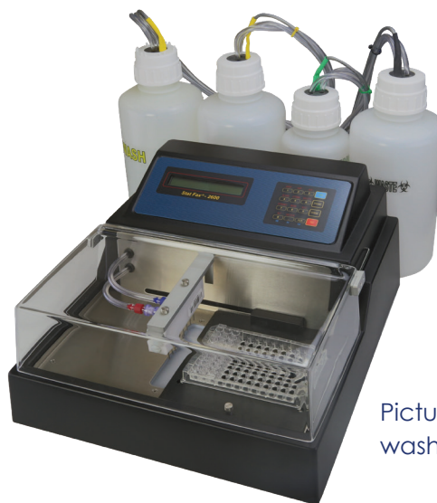
Pictured with optional wash bottle

Awareness Technology, Inc. ASIA & AFRICA Q3-146, SAIF Zone, 120543, Sharjah, United Arab Emirates tel.: +971 (06) 557 80 58, fax: +971 (06) 557 80 59 info@awaretech.com